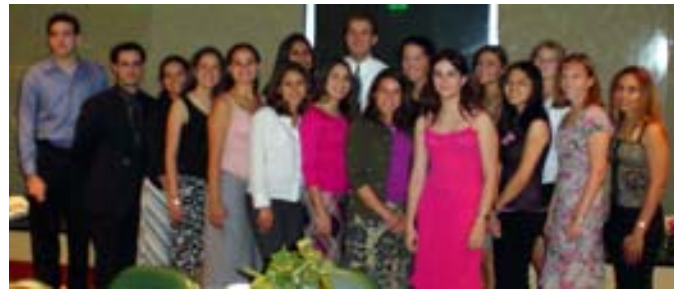
New 2004 Psi Chi Inductees