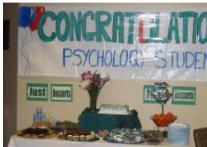
... cakes and sweets a plenty ..