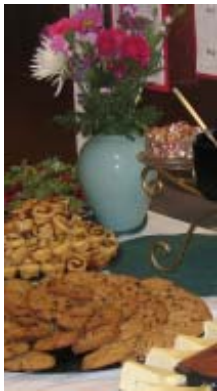
... There were cookies...