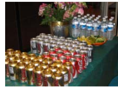
... a "UM" drink display ...