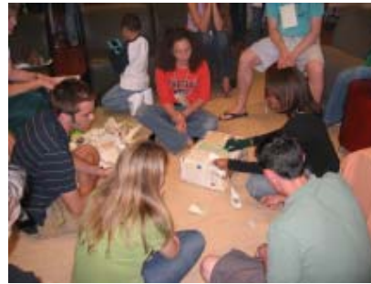
... finalists trying to win a color printer ...