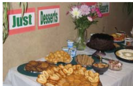
... nuts, fruits, and cheeses...