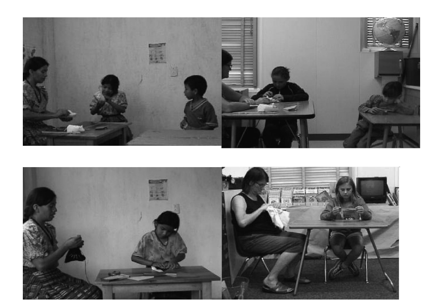
Figure 1. Scenarios for Sessions 1 and 2. Session 1. Mayan (top left) and European American (top right) children wait their turn and attend (or not) to the Toy Lady and their sibling constructing the mouse toy. Session 2. Mayan (bottom left) and European American (bottom right) children attempt to construct a frog by themselves, while the Toy Lady is busy with her work.

the nonaddressed children would do naturally as they waited, so she should neither encourage them to do anything nor inhibit them from doing anything.