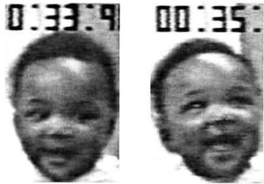
Figure 1. An infant's non-Duchenne smile (on the left), followed approximately 2 s later by a Duchenne smile (on the right) in which the cheeks are raised more prominently.

An average of 60% of Duchenne smiles were immediately preceded by non-Duchenne smiles (see Figure 1 for an example). A statistical comparison of observed and expected transition probabilities indicated that Duchenne smiles were also more likely to be preceded by non-Duchenne smiles than one would expect by chance, t(12) = 4.84, p = .000 . 3 Nevertheless, an average of only 30% of non-Duchenne smiles were followed by Duchenne smiles. In fact, non-Duchenne smiles were more likely to relax into nonsmiles than to be followed by Duchenne smiles, t(12) = -3.82, p = .002 . In sum, non-Duchenne smiles